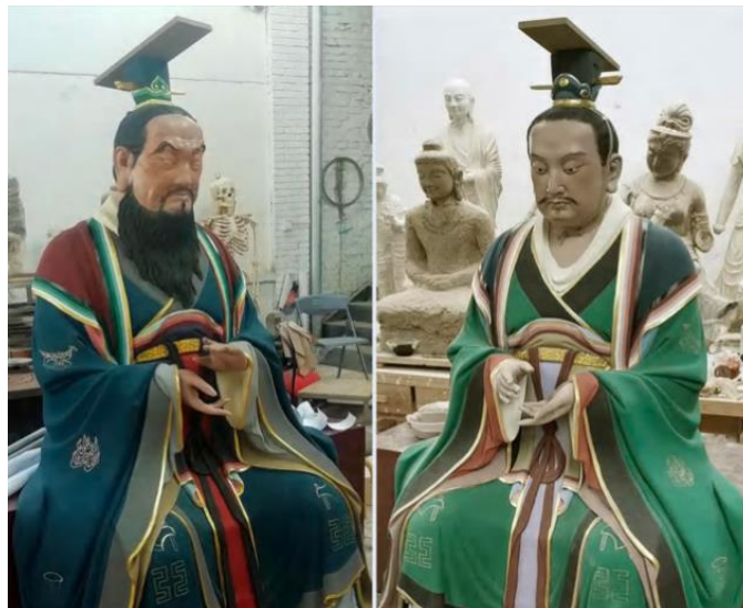
Figure 3 Colored sculpture production

Usually, colored sculptures (shown in Figure 3) are made of clay mixed with fiber, sand, glue, alum, and water, and then shaped on a wooden skeleton, dried, caulked, polished and primed, and then colored. The Dunhuang sculpture-making technique was announced by the Gansu Provincial People's Government in 2008 as a list of intangible cultural heritage in Gansu Province, which shows its importance in cultural heritage.