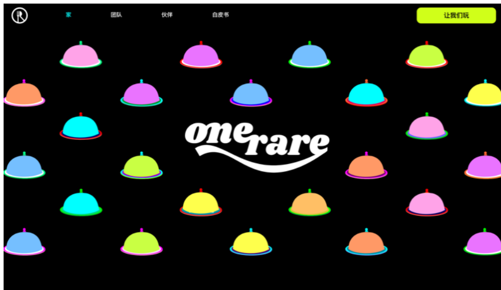
Figure 4 One Rare home page

The metaverse is the future trend of the Internet, and non-genetic heritage must keep up with the development of the Internet era in order to have successors and stable economic security to pass on. I take One Rare, a very hot food meta-universe world, as an example to learn how this product is built to let "food" run through the virtual world and the real world and to think about whether this operation mode can run in the meta-universe context of grotto art. brings the global food industry to WEB3 for the first time, (as shown in Figure 4). Players can request NFTs from favorite chefs, brands, and restaurants, access culinary and social food experiences and earn revenue to exchange NFTs for regular meals through simple gameplay. This is a revolutionary shift in the metaverse industry, combining the online NFTS experience with the actual offline experience, a process in which the virtual and real worlds gain from each other. The culinary abilities learned in the game can be translated into actual offline culinary experiences through tokens. The company is committed to the cause of ending world hunger by partnering with the restaurant industry and the WEB3 program to raise funds and awareness, a company with ambition and a humanistic vision at the same time. Could this be how our cave art bridges the virtual and real worlds, transforming the online learning process into actual offline practice to excavate caves and appreciate the beauty of cave art?