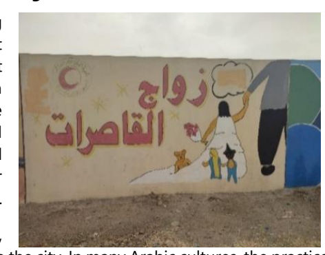
Figure (51) is posted on a wall in Talafer Taxi Garage on the Right Coast of Mosul, which is mostly populated by Arab tribes, who relocated from the suburbs of Mosul to the city. In many Arabic cultures, the practice

The extract in Figure (51) is a critique that highlights child marriage; it is a distressing social issue where parents arrange forced marriages for underaged girls. The extract appears in MMA in mosul reads: "زواج القاصرات", (Lit.: Say No to child marriage). It directs society to stand against the practice of child marriage and take urgent action to eradicate this harmful tradition away from girls. Child marriage often has terrible consequences on the overall process of marriage, particularly on the psychological aspects of girls. It limits girls' access to education, restricts their options in life, and exposes them to health risks. Taking the specific location of MMA into account further reveals the MoAs' intention and the addressees to whom they convey their message.