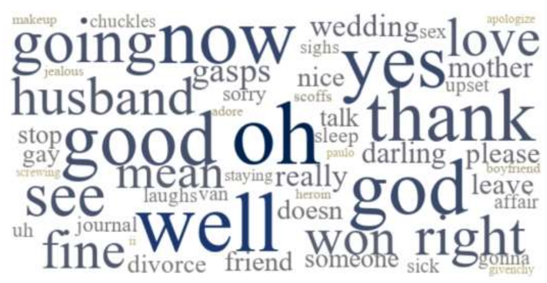
Figure 2 Simone's Word Cloud

The word cloud generated from Simone's lines from the whole season visually highlights her distinctive linguistic features. Prominent words such as "oh," "god," "well," "going," "right," and "thank" reveal Simone's dramatic, assertive, yet socially attuned discourse style. Compared to Beth Ann, Simone employs interjections more emphatically, notably phrases like "Oh my God" indicative of strong emotional reactions and expressive discourse acts, aligning with Lakoff's (1975) identification of interjections as characteristic of women's conversational discourse. These words underline Simone's tendency to openly express emotions, excitement, or astonishment.